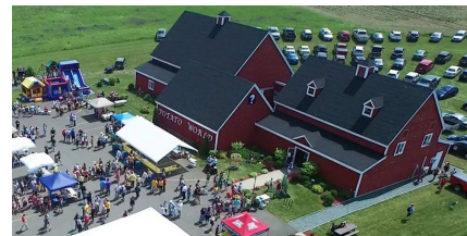
POTATO WORLD 45 minutes west at Exit 153-TCH www.potatoworld.ca