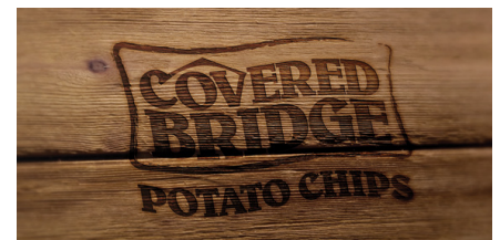
COVERED BRIDGE POTATO CHIP COMPANY 10 minutes west at Exit 172-TCH www.coveredbridgechips.com