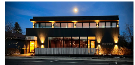
ON THE BOARDWALK CAFÉ & WINE 35 minutes west at Exit 153-TCH www.on-the-boardwalk.ca