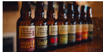
BIG AXE BREWERY 45 minutes east at Exit 231-TCH www.bigaxe.ca