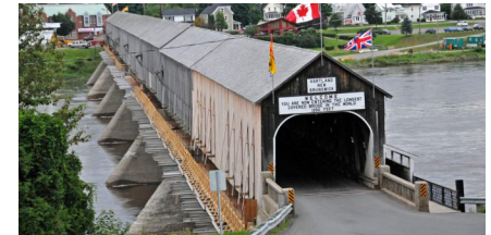
LONGEST COVERED BRIDGE IN THE WORLD 15 minutes west at Exit 172-TCH www.town.hartland.nb.ca