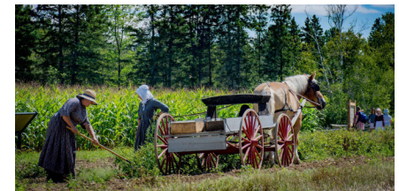
KING'S LANDING HISTORICAL SETTLEMENT 15 minutes east at Exit 253-TCH www.kingslanding.nb.ca