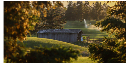
COVERED BRIDGE GOLF & COUNTRY CLUB 10 minutes west at Exit 172-TCH www.coveredbridgegolf.nb.ca