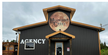
MOONSHINE CREEK DISTILLERY 10 minutes west at Exit 172-TCH www.moonshinecreek.ca