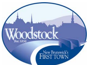
"New" LOGO adopted in 2005