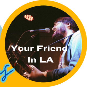
Your Friend In LA